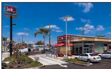
Jack in the Box, San Pedro, CA