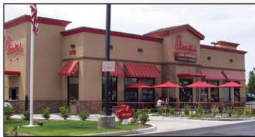
Chick-fil-A, Bakersfield, CA