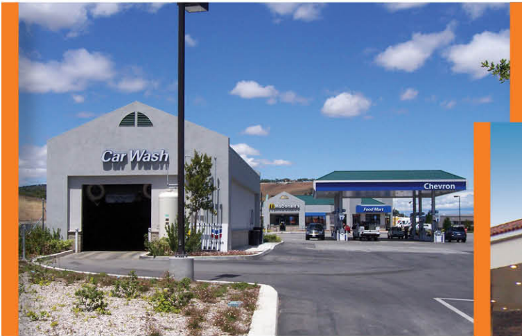
Chevron, Paso Robles, CA