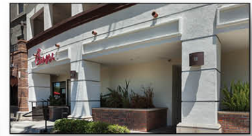
Chick-fil-A, USC, CA