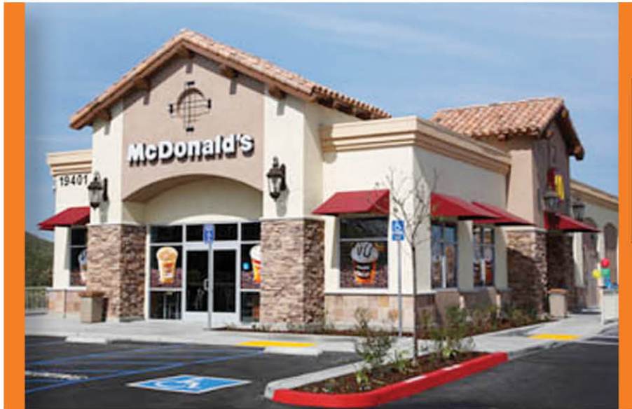
McDonald's, Santa Clarita, CA