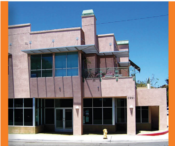
Loma Vista Mixed Use - Office/Retail/Residential Ventura, CA