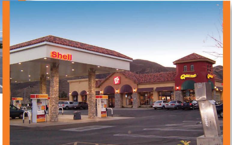
Shell, Fontana, CA