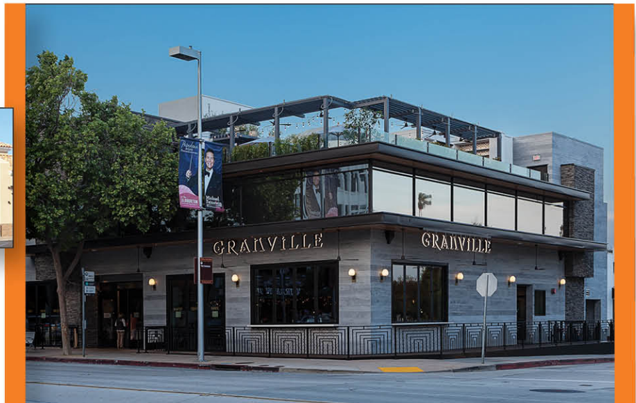
Granville Café, Pasadena, CA