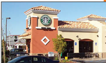
Starbucks Coffee, Santa Clarita, CA