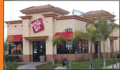
Jack in the Box, Colton, CA