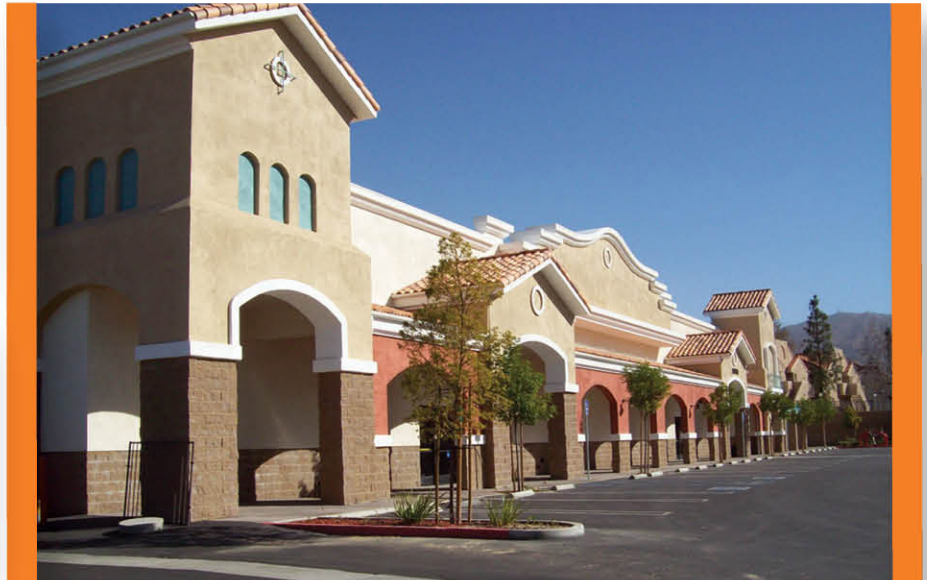
Tres sierras Market, Santa Clarita, CA