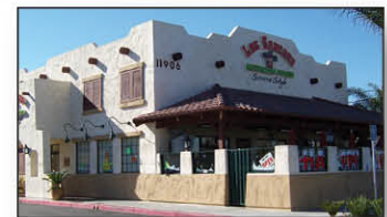
Los Sanchez Mexican Restaurant, Garden Grove, CA