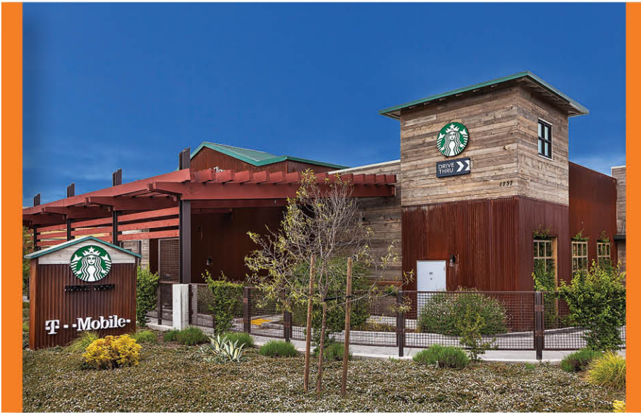
Broadway Commons Retail Center, Santa Maria, CA