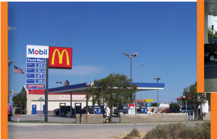
Mobil, Lost Hills, CA