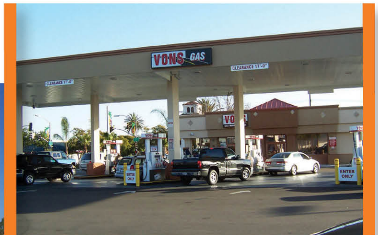
Vons Gas Station, Pacific Beach, CA