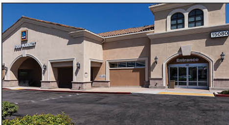
ALDI Foods, Fontana, CA