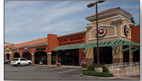
Newhall Retail Center, Newhall, CA