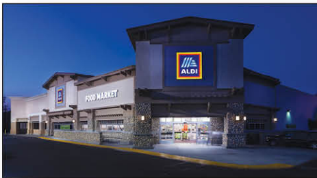
ALDI Foods, Santa Clarita, CA