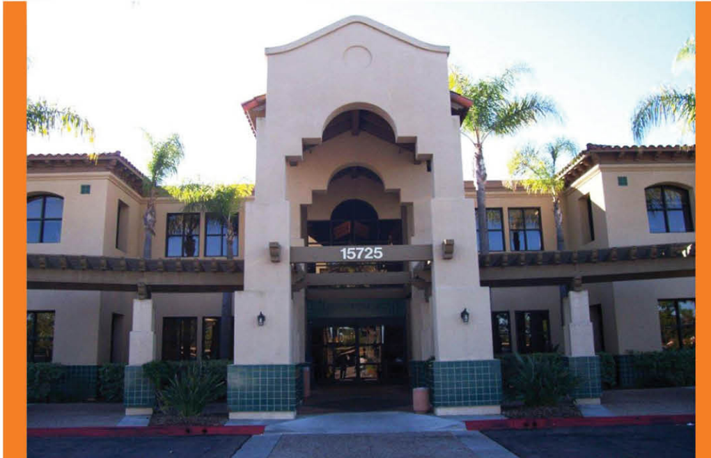
Gateway Medical Center, Poway CA