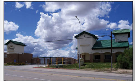
Paso Robles Self Storage, Paso Robles, CA