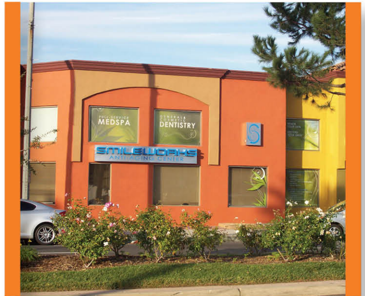
Smile Works Dental, Redondo Beach, CA